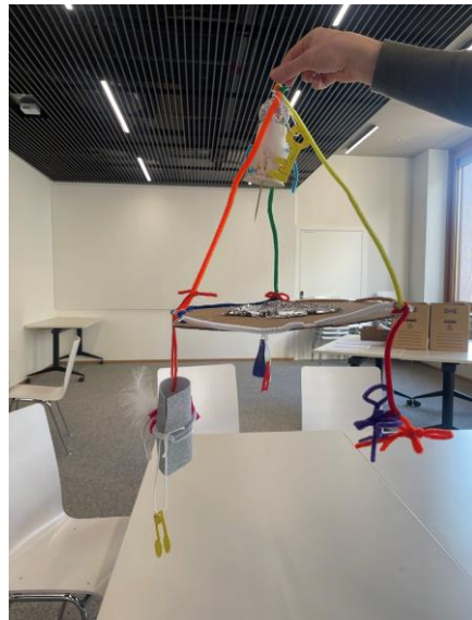
The Boss Mobile Assistant